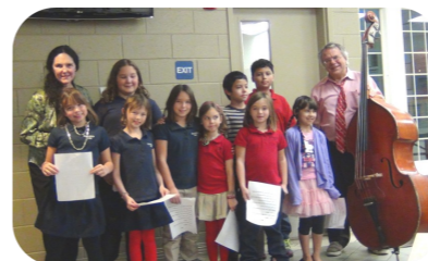
Youth enjoying a free music & poetry writing class.