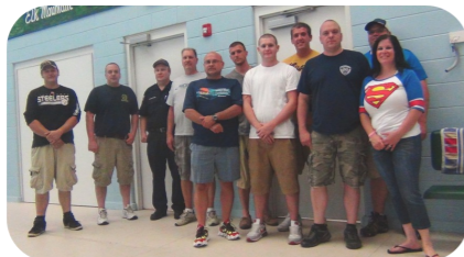
Local firefighters take a tour of the Y to ensure everyone's safety.

The 21 st Century Capital Campaign raised over $9 million in pledges for the remodeling and renovation of the YMCA. However, several significant pledges were left unfulfilled and the Y was left with a $1.8 million debt. In March of 2014, the Greater Carbondale YMCA kicked off a limited Capital Campaign in an effort to relieve this financial burden. At this time, the YMCA was able to announce two matching grants. The Weinberg Foundation is reviewing a proposal for $750,000 to be matched with $250,000 from the Frieder Foundation and Gentex Corporation. An additional $270,000 has been pledged through private and corporate sources. We're spreading the good news to all of our friends and advo-